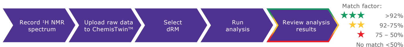
Figure 1. Workflow of the structure verification using ChemisTwin.

The automated structure verification capabilities of ChemisTwin™ were assessed with ^1\text{H} spectra of 65 different molecules with structures corresponding to existing dRMs. The raw data from these spectra were compressed and uploaded to the ChemisTwin™ portal. The appropriate standard for comparison with the sample spectra was then selected, and the structure verification analysis was conducted. ChemisTwin provided the results, offering a match factor quantifying the agreement between the sample and standard spectra (Figure 1).